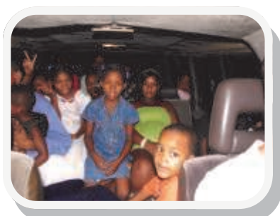
Not shown are the two behind the back seat and two in front.