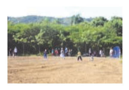
Baseball practice in the field where the vocational school.

recently Jim told me about the plan for a woodshop vocational school. It was a small vision of a small building and only a couple of vocations being taught. Now the vision has grown. There is another location that has been purchased and the plans for the building size has more than doubled from the original plan. The position