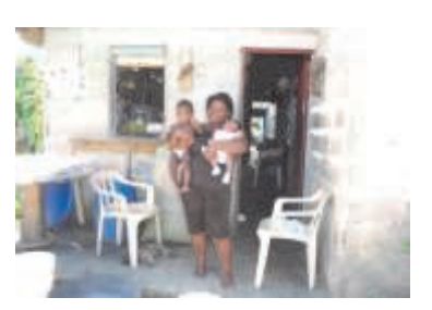
Friends in Villa Paraiso

have enough to give. But I believe that is how God works, not through our abundance but from our lack does He bless. I have seen so many who gave from their lack and were blessed with peace and contentment not of this world.