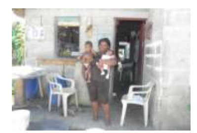
Friends in Villa Paraiso

have enough to give. But I believe that is how God works, not through our abundance but from our lack does He bless. I have seen so many who gave from their lack and were blessed with peace and contentment not of this world.