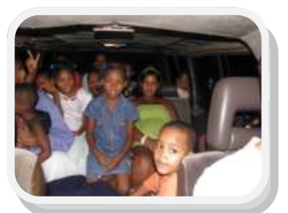
Not shown are the two behind the back seat and two in front.

Enter His courts with Thanksgiving and Praise